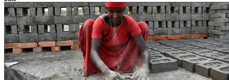
Source: Department of State, 2020 Trafficking in Persons Report. Photo by Reuters. | GAO-21-53

Indian Woman Exploited through Bonded Labor at a Brick Factory in Rural India, According to State