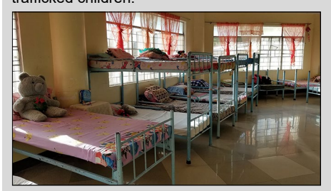
Source: GAO analysis of U.S. Agency for International Development (USAID) documents. | GAO-21-53

Through the Philippines-American Fund as its implementing partner, USAID awarded six grants to combat trafficking in persons in the Philippines. According to USAID, one of the grants supported a local organization operating a shelter for trafficked children in one of the country's known trafficking hotspots. The shelter has supported 70 children since receiving the $440,000 grant in 2014. The photo shows a bedroom for trafficked children.