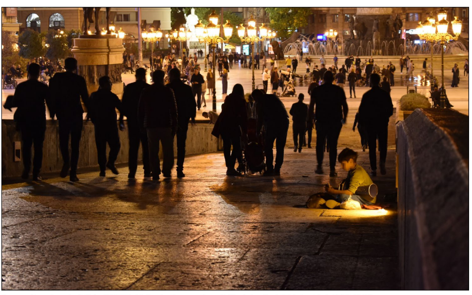
Figure 2: A Child Forced to Beg in a Busy Town Center in North Macedonia, According to State

Source: Department of State, 2020 Trafficking in Persons Report. Photo by Atsuki Takahashi. | GAO-21-53